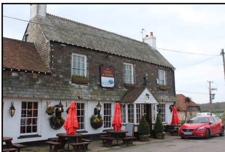
The Coach and Horses pub