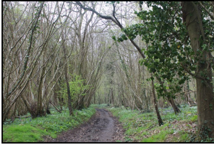
A well defined path takes you up into Clapham woods

Retrace your footsteps to the point where you turned left out of the field onto the track that led to the tarmac road. Instead of crossing the stile back into the field,