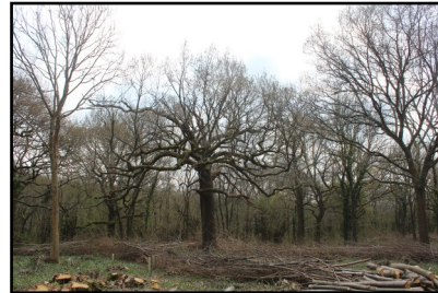
The pretty woodland seen as you follow the path south.

bisected by a track called Grub Ride - keep to the main path. After about 1km, the path joins a new path at a T junction. Turn right onto this path. For about 800m the path continues to wind its