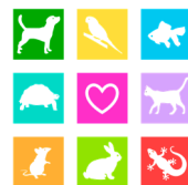
Heene Road Vets passionate about pet care

When it comes to veterinary care, you want only the best for your pet. We understand that your pet is an important member of your family and we understand the