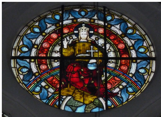
Stained glass window at St Botolph's depicting Christ seated in glory.