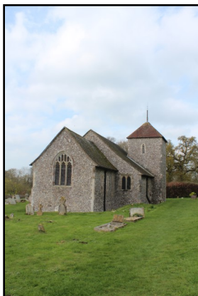
St. Mary the Virgin, Clapham.

This month's cover picture is of the start of a walk to the church of St. Mary the Virgin, Clapham. The starting point is the Coach and Horses pub on the Arundel Road (A27). From the pub, walk west along the path. After 300m you will see a footpath sign on the North side of the road. Cross the road and follow this path. After 200m you will come to some farm buildings and another footpath sign. The sign points diagonally across a field but the field is often planted with wheat