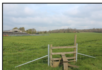
Not always easy to walk diagonally across the field.

and no visible path. It is easy to walk round the south and west edge of the field to the exit